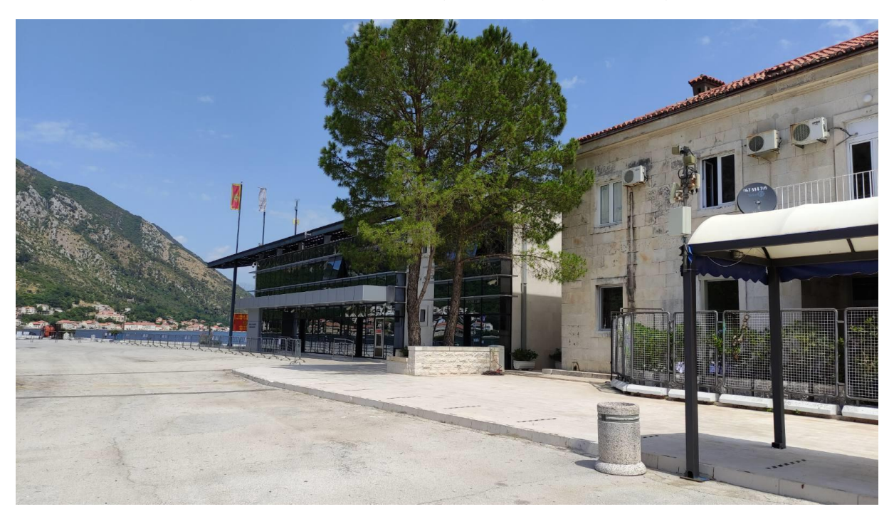
Figure 1: Passenger terminal entrance – view from the main street

On the second floor you can find the offices of the port security service and operations.