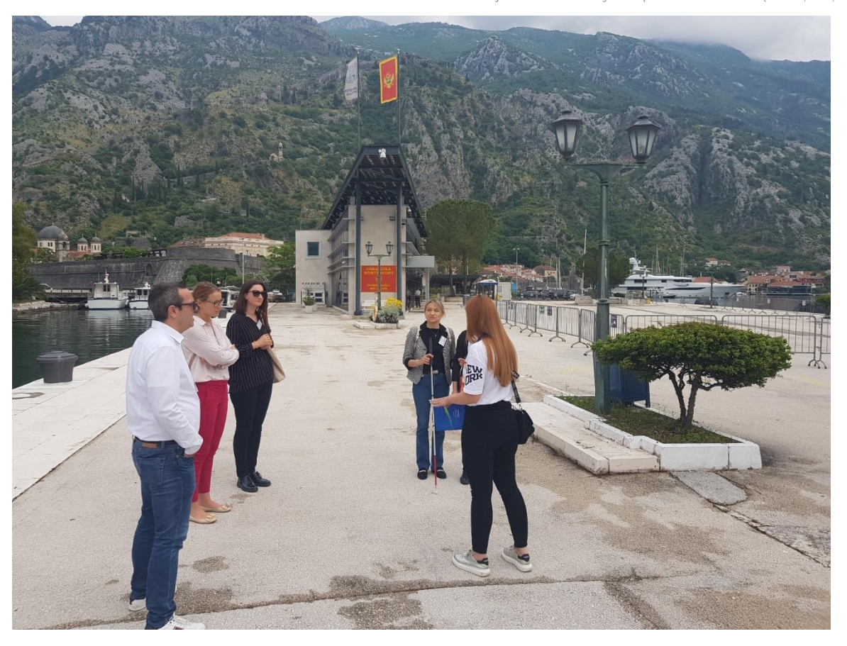
Figure 5: Assessment of accessibility of Port of Kotor

Project co-funded by European Union funds (ERDF, IPA, ENI)