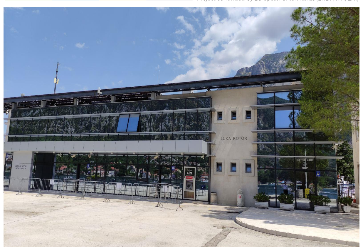
Figure 2: Passenger terminal exit / entrance

Project co-funded by European Union funds (ERDF, IPA, ENI)